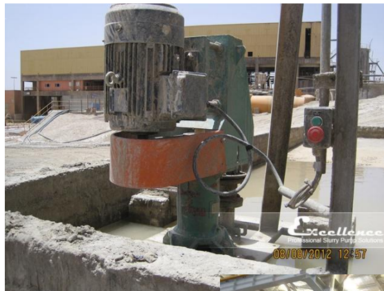
EVM-40P Copper Mineral Processing in Africa