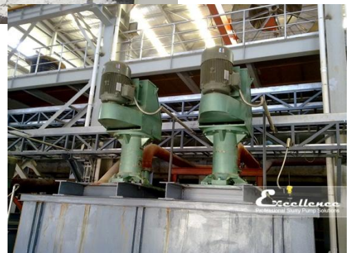
EVM-150S in Chinese Gold Processing Plant