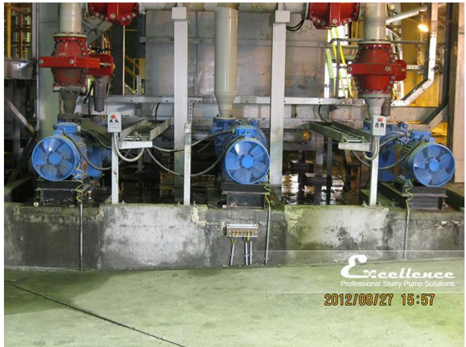
EHR-3C Copper-molybdenum Plant In Mid-East