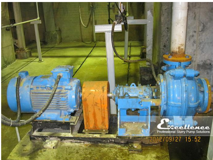
EHR-3C Copper-molybdenum Plant In Mid-East