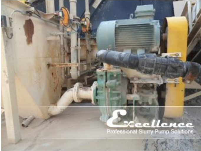
EHR-4D in the calcium carbonate factory in Asia